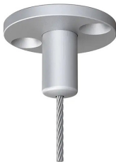
SURFACE MOUNT Cable Gripper Supplied by Altispace