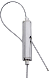
Cable Gripper Supplied by Altispace